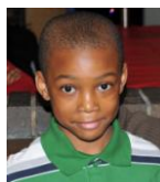
Neighbor of the Year Award